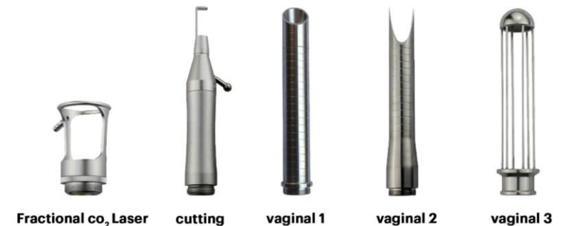
Fractional co 2 Laser