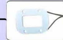
The same annular TEC cooling as alma, speedal cool SCT