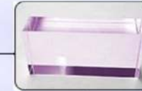
Vacuum magnetron sputtering 2.0 laser guide no energy loss